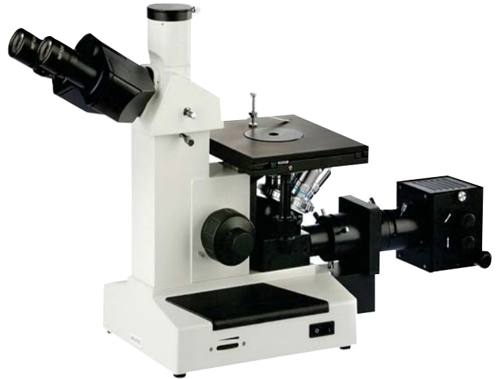
MODEL : BMI-101A