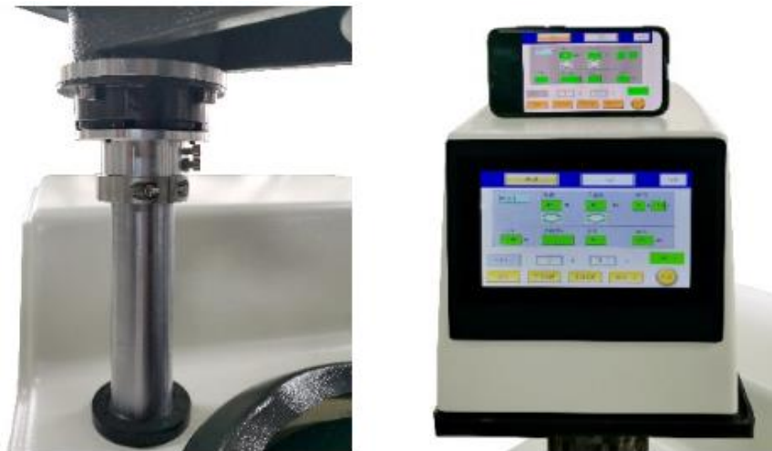
Electromagnetic automatic lock & remote