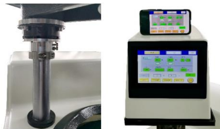
Electromagnetic automatic lock & remote